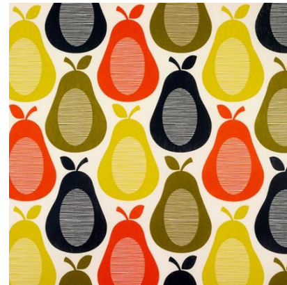
Artist Study: Orla Kiely